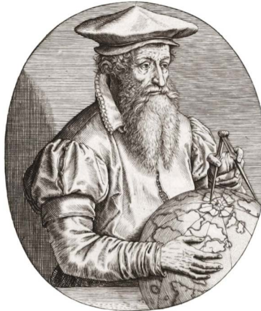
Gerhard Mercator (1512 – 1594), renowned mathematician, geographer, cartographer, and patron of the School of Management on Duisburg Campus, lived in Duisburg from 1552 till his death.

BEST offers a variety of courses in business, economics and German language with special emphasis on the European economic environment. The program also includes field trips and company visits to the industrial and cultural vicinity of Duisburg and a weekend excursion to Berlin.